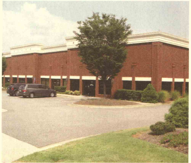
Neuhaus Neotec's new office in Atlanta, Georgia

Special requests will be forwarded immediately to the specialized engineers in Germany and followed up by them. Neuhaus Neotec customers will have the option to order spare and wear parts directly via the new office and get regular updates on the process if needed. The warehouse also has enough space to stock large or bulky spare parts.